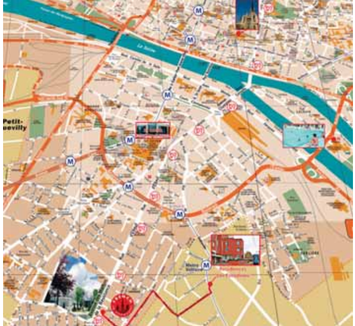
City Map showing FIN

Because we don't just say we care we really do!