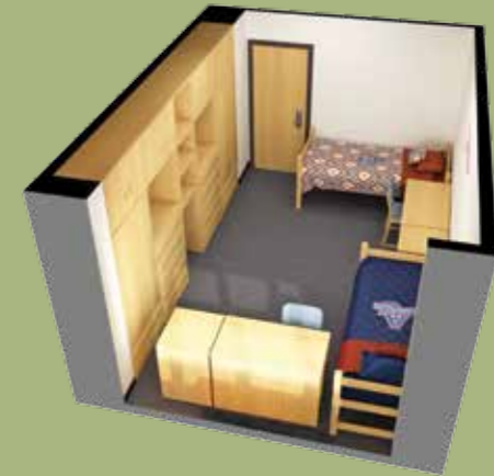
Image of sample double on-campus room